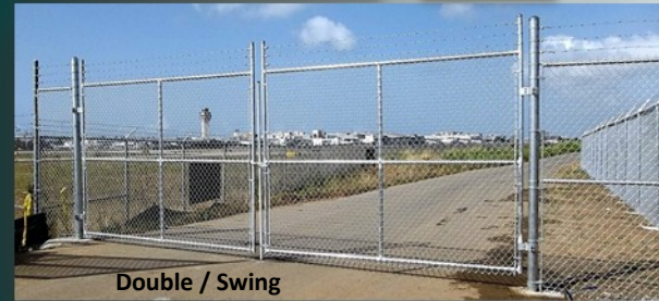
Double / Swing