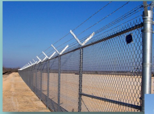
Federal Government Specifications