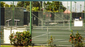
Tennis and Basketball Courts