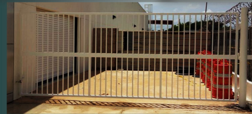
Iron Gates (swing / sliding / electrical)