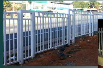
Over Concrete Walls